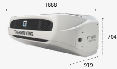
T-1200R WHISPER™ PRO/ T-1200R SPECTRUM WHISPER™ PRO