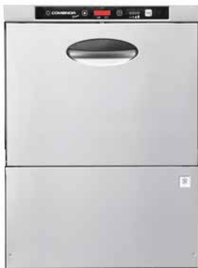
MODEL PF 45