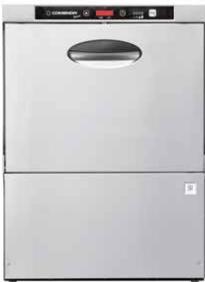
MODEL PB 24