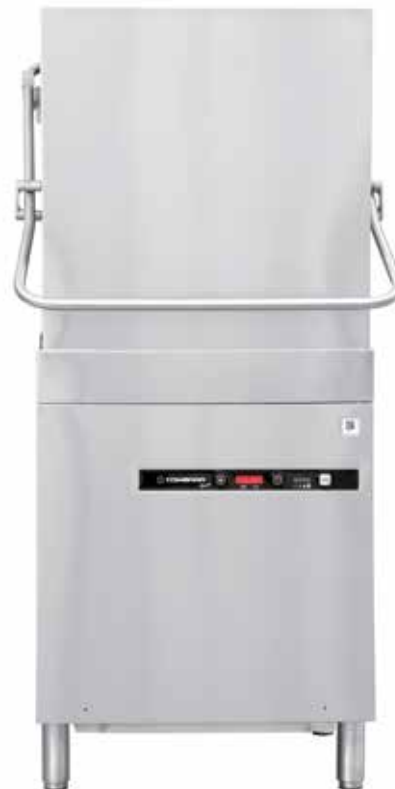
MODEL PC 09